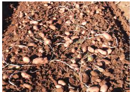
70 % + PENERGETIC