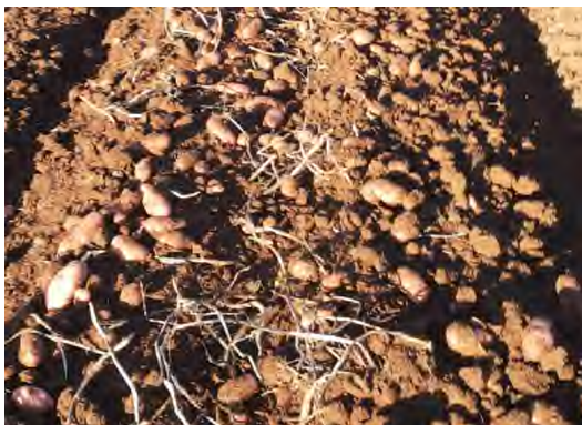
50 % + PENERGETIC