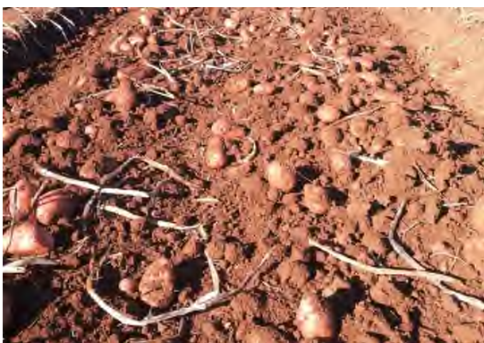
100 % + PENERGETIC